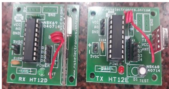
Fig. 2 RF MODULE

For many applications the medium of choice is RF since it does not require line of sight. RF communications incorporate a transmitter and a receiver. They are of various types and ranges. Some can transmit up to 500 feet. RF modules are widely used in electronic design owing to the difficulty of designing radio circuitry. RF modules are most often used in medium and low volume products for consumer applications such as garage door openers, wireless alarm or monitoring systems, industrial remote controls, smart sensor applications, and wireless home automation systems. They are sometimes used to replace older infra-red communication designs as they have the advantage of not requiring line-of-sight operation.