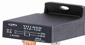
Fig. 4 RELAY