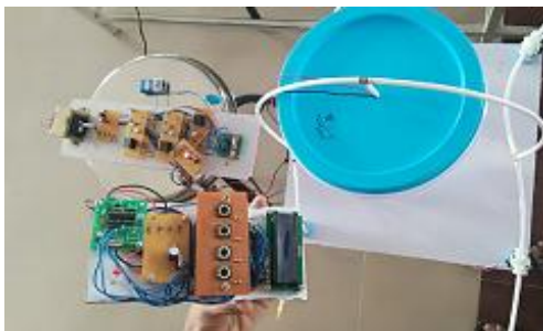
Fig. 5 Hardware setup

The below figure shows the receiver and transmitter with the water supplying tank. It consists of a LCD display to display the output.