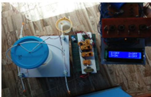
Fig. 6 Hardware running condition

The prototype figure shows the running condition of the valve 3. It is displayed in the LCD. After the programmed